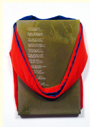
"Chuckles (1848)," Frankfurt Enamel, Imron on panel on wool sweater [European revolutionary poetry] 28" x 18" 1990