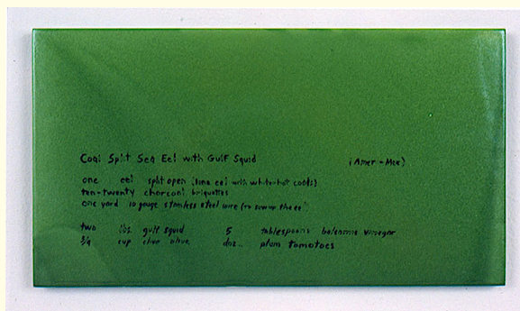
"Coal Split Sea Eel" Enamel, Imron on aluminum 17" x 11" 1989