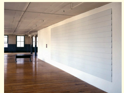
"Untitled (Kane/Pearlman)" Laminated photograph, aluminum siding, Haworth office desk, encaustic on aluminum 10' x 30' x 6' 1989