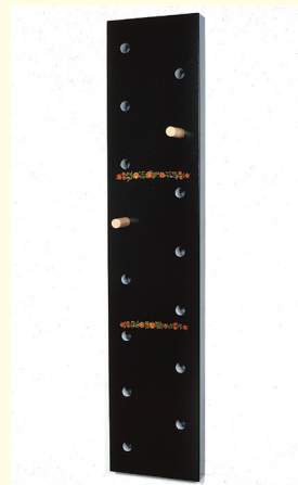
"Margin Pegboard" Enamel on Steel 18" x 72" 1989