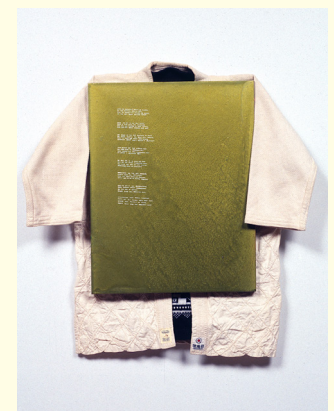
"Early April (1848)," Frankfurt Enamel, Imron on panel, wool on judogi [European revolutionary poetry] 32" x 22" 1990