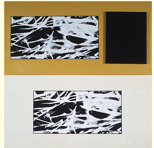
"Poly/Mono" Stretched plastic bag, laminated photographs, enamel on aluminum 28" x 32" 1988