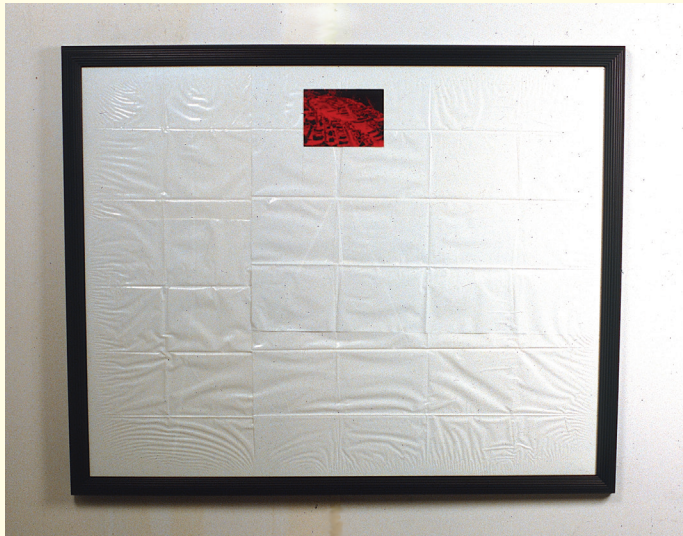
"Peru" Laminated photograph, plastic bags, glass, frame 46" x 50" 1987